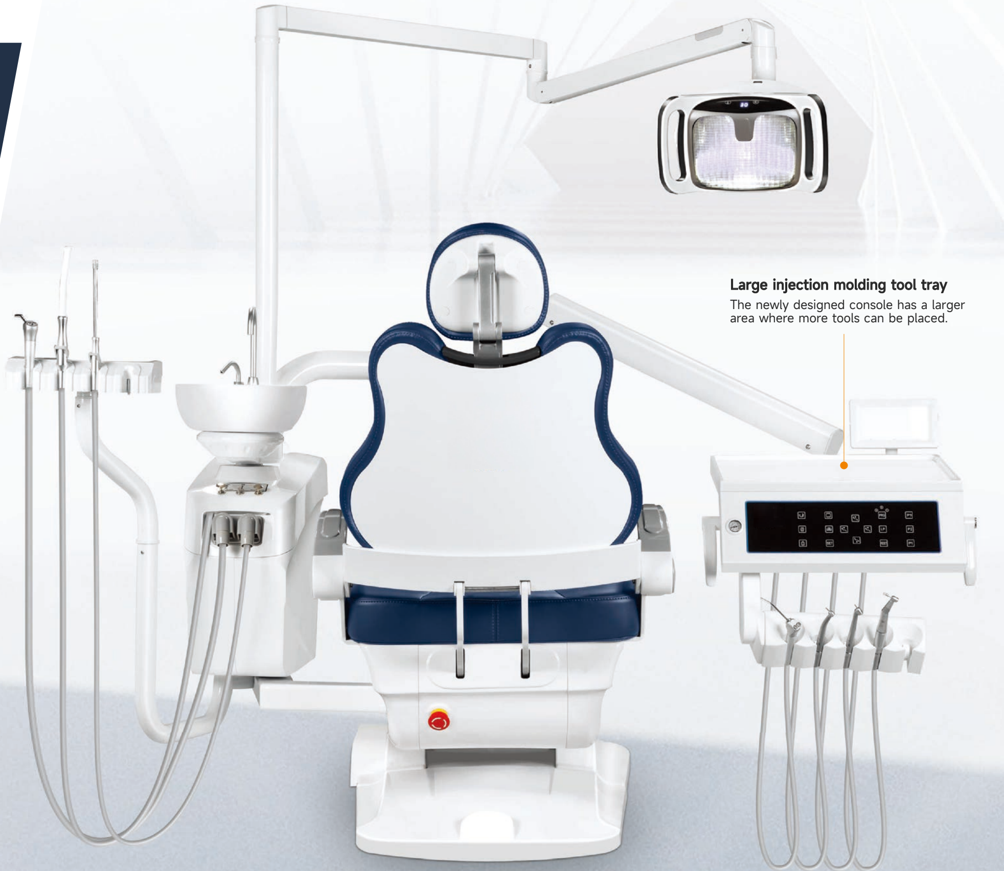
Large injection molding tool tray The newly designed console has a larger area where more tools can be placed.